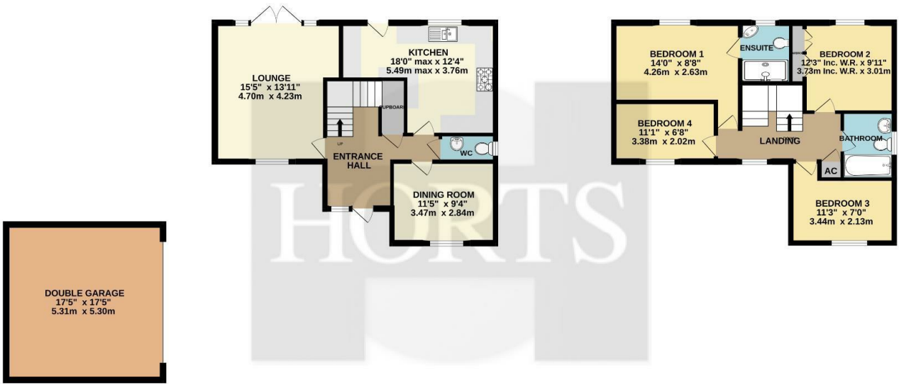
1ST FLOOR 585 sq.ft. (54.4 sq.m.) approx.

TOTAL FLOOR AREA: 1512 sq.ft. (140.5 sq.m.) approx.